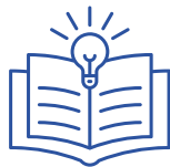
COLLEGE & CAREER READINESS

United Way Youth Programs and Initiatives are working to promote College & Career Readiness, Health & Wellness, Economic Stability, and Community Connection.